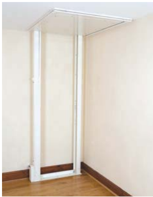
Lower room when lift upstairs