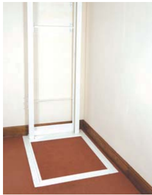
Upper room when lift downstairs