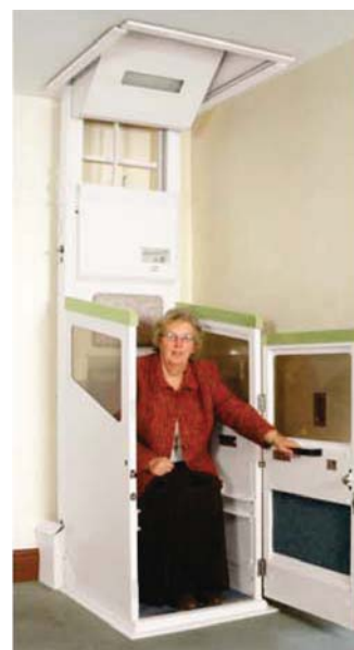
Harmony Compact at lower level with fixed seat.