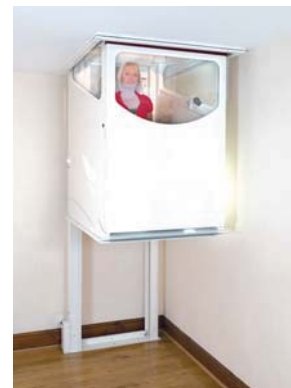
Lift approaching lower floor