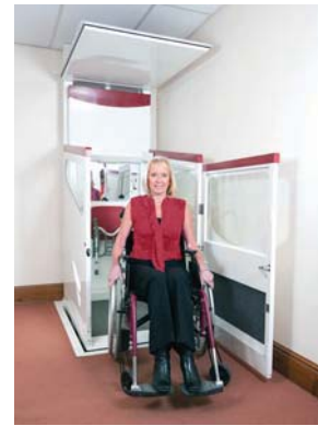
Entering the lift upstairs

Both lift-up aperture infill and car underpan are designed to provide a minimum half hour fire protection and both are fitted with smoke and intumescent fire seals. Pressure sensitive safety surface is incorporated in the floor aperture infill which will stop the lift if it is obstructed.