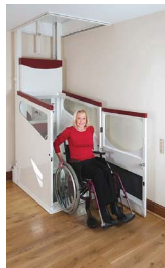
Harmony allows you to move between floors smoothly and safely. Can be used with or without your wheelchair. Fold-up seat available.

Operation is simple. Having called the lift from the easily accessible wireless wall control (with no unsightly plastic trunking), sited to suit the user, the car door can be opened by the same control. The low integral ramp allows easy wheelchair access and a push button inside the car closes the door. A push of the car control button (which can be positioned by the user to suit their needs - not available on the Compact model) will signal the car to travel to the other floor, automatically lifting or replacing the aperture ceiling panel en route, where the reverse procedure is followed to exit the car.