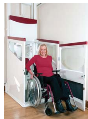
Exiting the lift downstairs